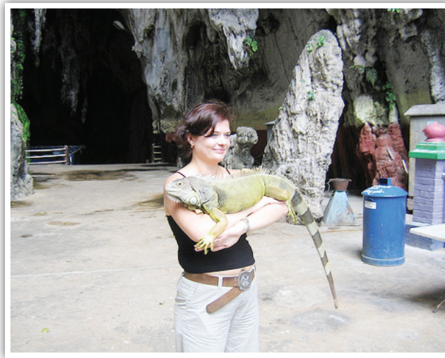
REPTILIAN ENCOUNTER: Getting close and personal with a cold-blooded native at Batu Caves

of my life, I am constantly amazed by how much there is still to learn about the French culture.